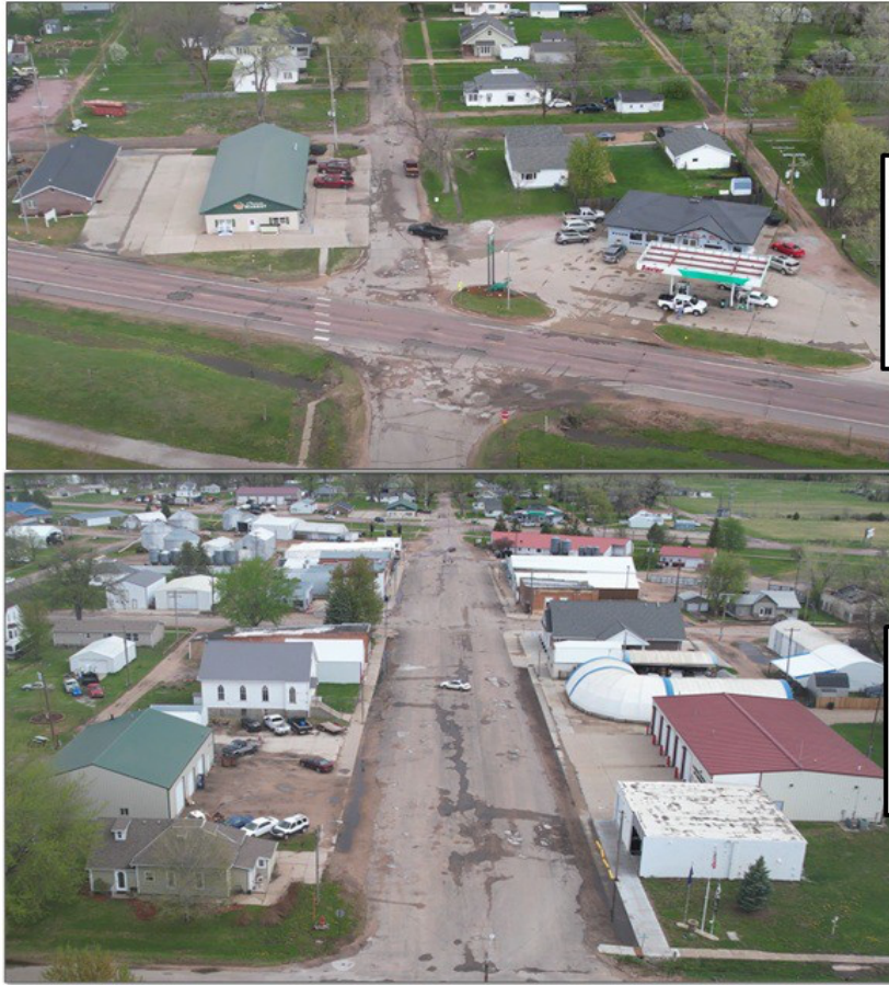
Downtown Clearwater Study Area North Side of Highway 275, Photo taken from just south south of Highway 275